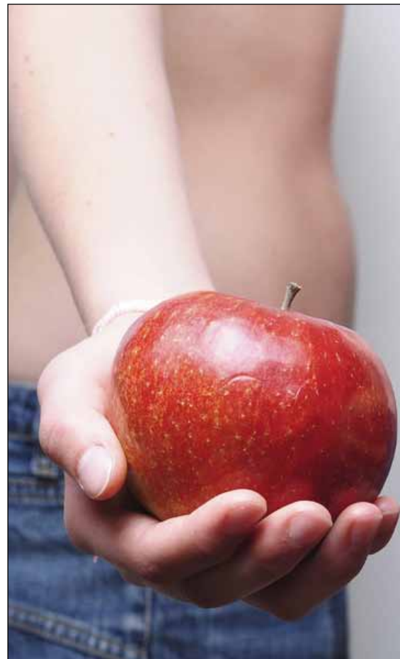
It is important for couples to focus on fertility health th